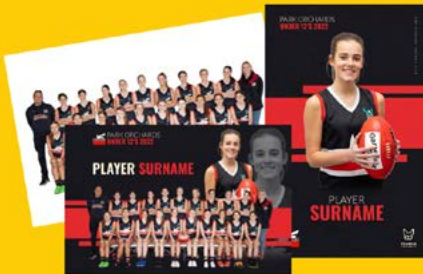
VALUE PACK | $60