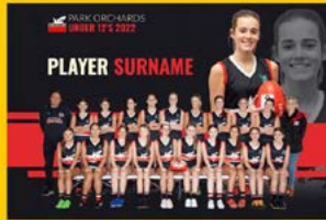
TEAM & PLAYER PHOTO | $33 OR $45