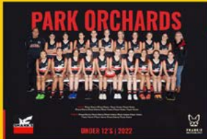
TEAM PHOTO | $25