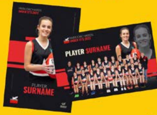
TEAM + INDIVIDUAL | $35