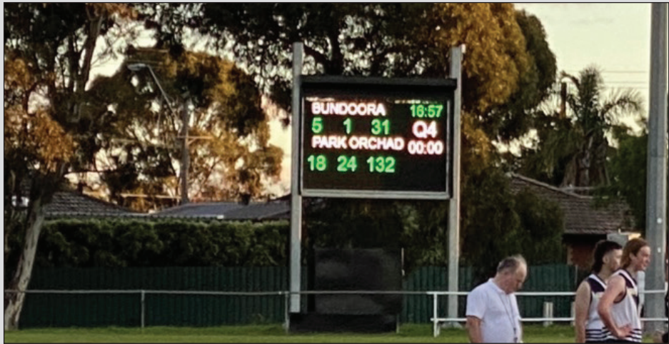
Great win by U16 black for Bruiser's 100th game

U11 Park Orchards 13.10.88 defeated Banyule 0.0.00 U12 Park Orchards 5.4.34 defeated Whitehorse Colts 3.9.27 U13 Park Orchards 3.3.21 defeated by Glen Iris 4.4.28 U14 Black Park Orchards 6.12.48 defeated Brunswick 1.5.11 U14 Red Park Orchards 8.9.57 defeated Preston Bullants 3.4.22 U15 Red Park Orchards 6.14.50 defeated Bulleen Temp 2.10.22 U16 Black Park Orchards 7.9.51 defeated St Marys 4.4.28 U16 Red Park Orchards 7.12.54 defeated St Marys 5.5.35 Colts Park Orchards 5.8.38 defeated by Fitzroy Colts 5.10.40